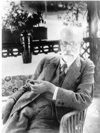
Sigmund Freud (1856-1939)