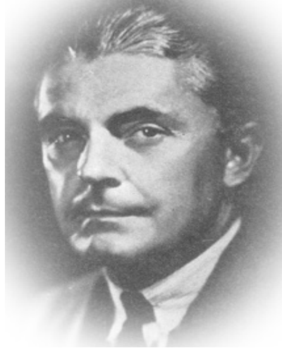
J.B. Watson (1878-1958)