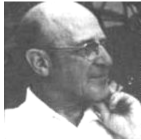
Carl Rogers (1902-1987)

The other prominent humanistic psychologist was Carl Rogers who was born near Chicago, U.S.A., in 1902 and died in 1987. His education started from the second grade, because he had already read before kindergarten. He got his PhD in educational psychology from New York in 1931 and worked at Ohio State and University of Chicago. He was offered a full professorship at Ohio State in 1940. In 1942, he wrote his first book, Counseling and Psychotherapy . Then, in 1945, he was invited to set up a counseling center at the University of Chicago. It was while working there in 1951 that he published his major work, Client-Centered Therapy , wherein he outlines his basic theory.