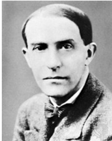
Kurt Koffka (1886-1941)