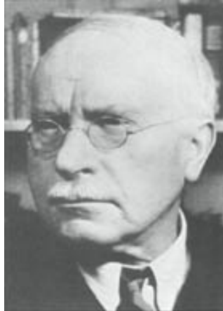
Carl Gustav Jung (1870-1961)