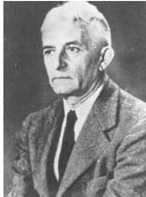
Wolfgang Kohler (1880-1943)