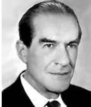
Alexei Leontiev (1904-1979)