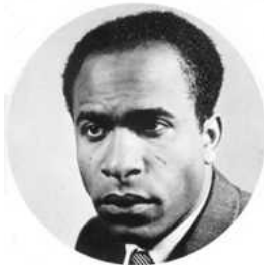
Frantz Fanon (1925-1961)

Third world countries are considered those regions and countries that gained independence and self-rule after World War II. Some of these countries were under the direct occupation of the European countries and America; some others were under the control of other occupying forces. These countries included Pakistan and India, most of the countries in Africa, some in the Far East as Vietnam and Indonesia, and the biggest of them all was China. Where the II World War brought numerous sufferings to mankind, it also resulted in freeing most of these regions and countries from the curse of modern slavery or colonialism.