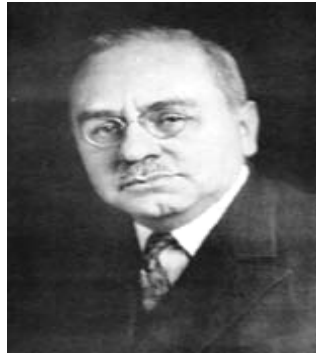
Alfred Adler (1870-1937)