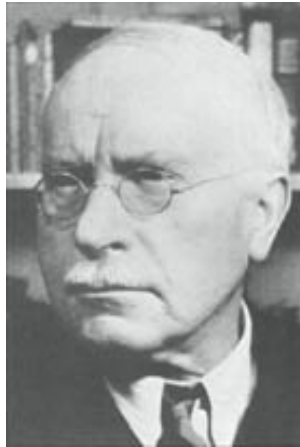
Carl Gustav Jung (1870-1961)